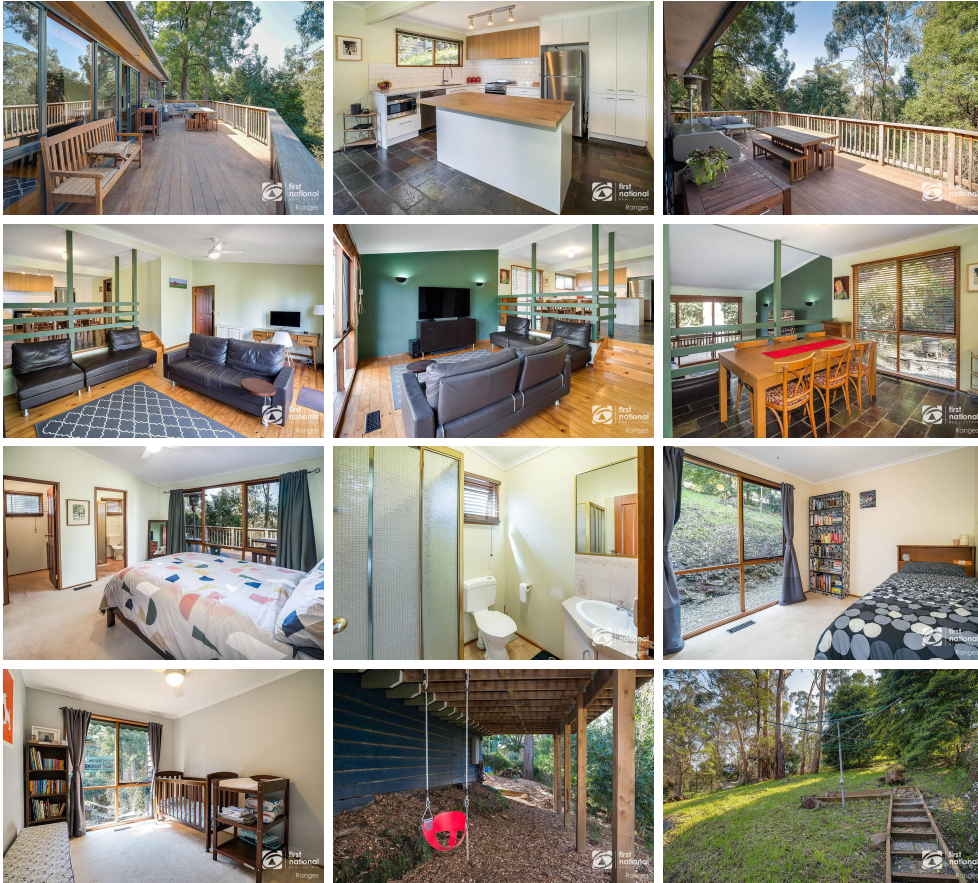
61 Kaola Street BELGRAVE